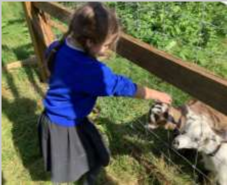
Getting to know the new goats

Rabbit class have very much enjoyed their weekly Drama class this term, particularly the singing, dancing and freedom of self-expression that the subject brings. As autumn sets in we will continue to look at our local environment, weather and changes that occur during this time of year and also go on a trip to RHS Wisley