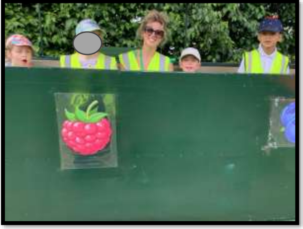
🚜 A Fruit-Filled Farm Day!

On Tuesday, we ventured out to the local fruit farm – and what a treat it was! The children had an absolute blast riding on the tractor, exploring the fields, and topping off the day with a well-deserved ice cream. It was a perfect blend of fun, fresh air, and fruity facts!