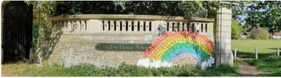
Gosden House School